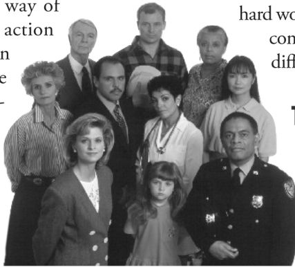
Deciding together to make a difference.

RBA is a disciplined way of thinking and taking action that communities can use to improve the lives of children, families and the community as a whole. RBA can also be used by agencies to improve the performance of their programs. RBA can be adapted to fit the unique needs and circumstances of different communities and programs.